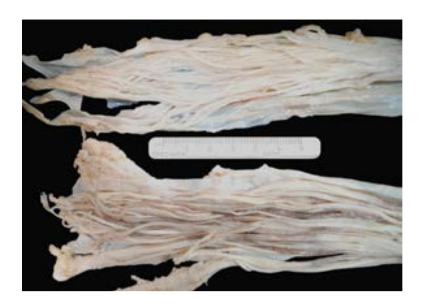
Figure 1. Normal cauda equina (top) and postmortem sample showing thickened nerve roots and cauda equina with patchy vascular prominence.