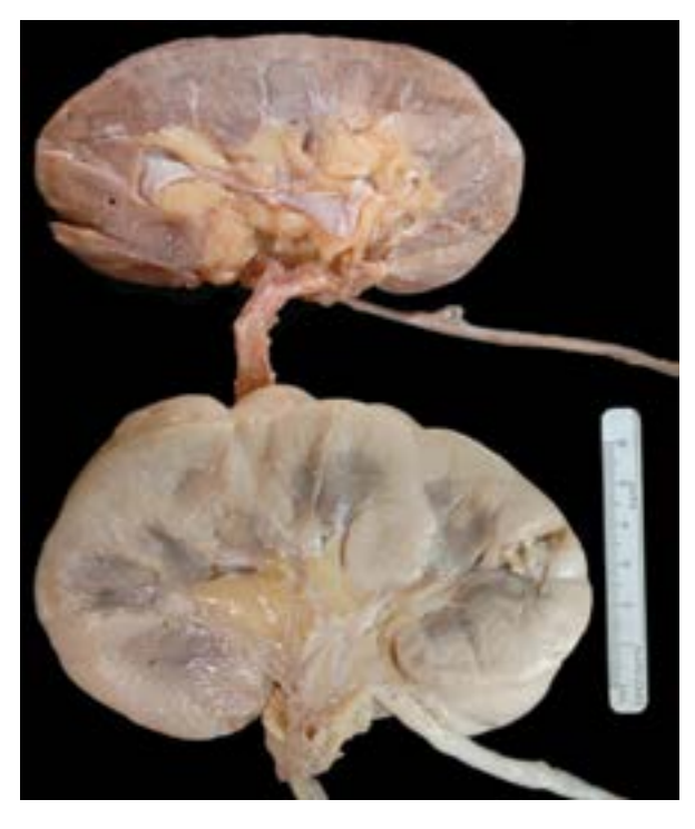
Figure 2. Normal kidney (top) and postmortem specimen with diffuse pallor and enlargement. The kidney weighed 388 g and measured 13.6 \times 8.1 \times 6.2 cm.

by a CD20-positive large B-cell lymphoma representing less than 10% of marrow cellularity.