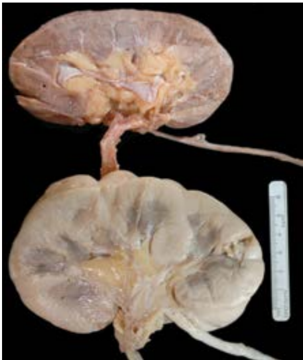
Figure 2. Normal kidney (top) and postmortem specimen with diffuse pallor and enlargement. The kidney weighed 388 g and measured 13.6 × 8.1 × 6.2 cm.

by a CD20-positive large B-cell lymphoma representing less than 10% of marrow cellularity.