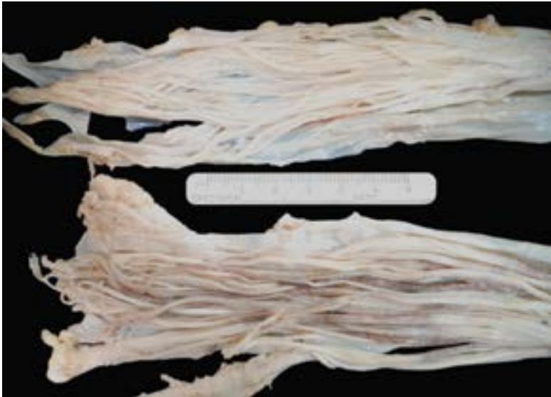
Figure 1. Normal cauda equina (top) and postmortem sample showing thickened nerve roots and cauda equina with patchy vascular prominence.